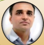
Shri Om Prakash IAS Commissioner of Agriculture, GoR